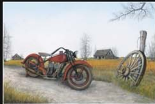
End Of The Road Alex Halliburton