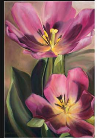
Pink Tulip Desiree Van Amsterdam

10% Off for SWCA Members in the month of February 2015!