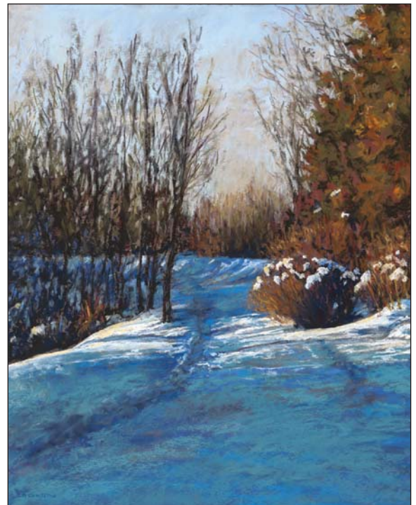
▲ December Light, University Avenue and Saskatchewan Drive / 20" X 16" / Soft Pastel

Growing up an Albertan meant incorporating its landscape in all the seasons into my consciousness; there is endless source material to work with. The inspiration for December Light , University Avenue and Saskatchewan Drive was the late afternoon winter light, falling horizontally across the snow. The effects of light are