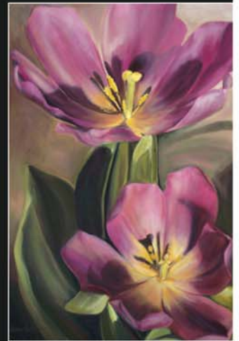
Pink Tulip Desiree Van Amsterdam