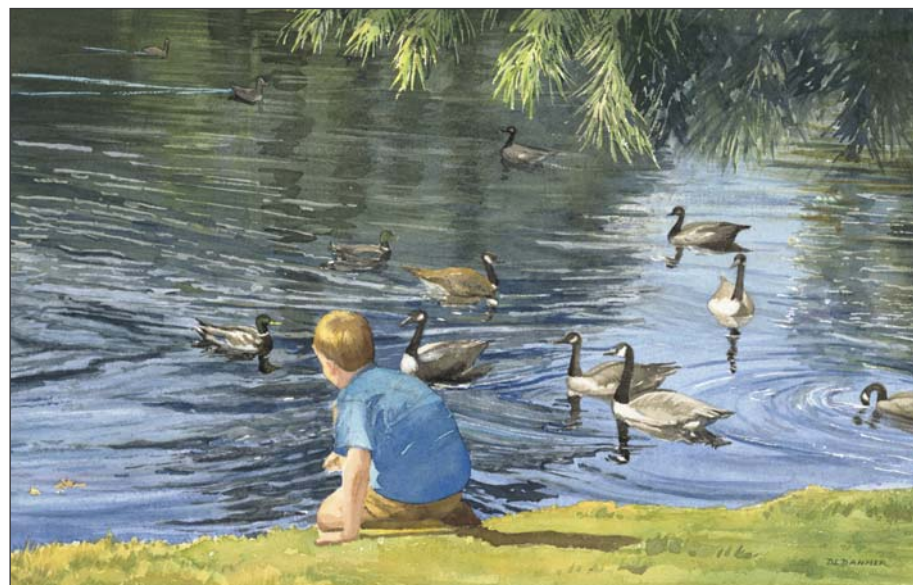
▲ Feeding Time at Beacon Park Hill / Watercolour