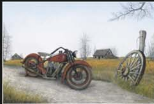
End Of The Road Alex Halliburton