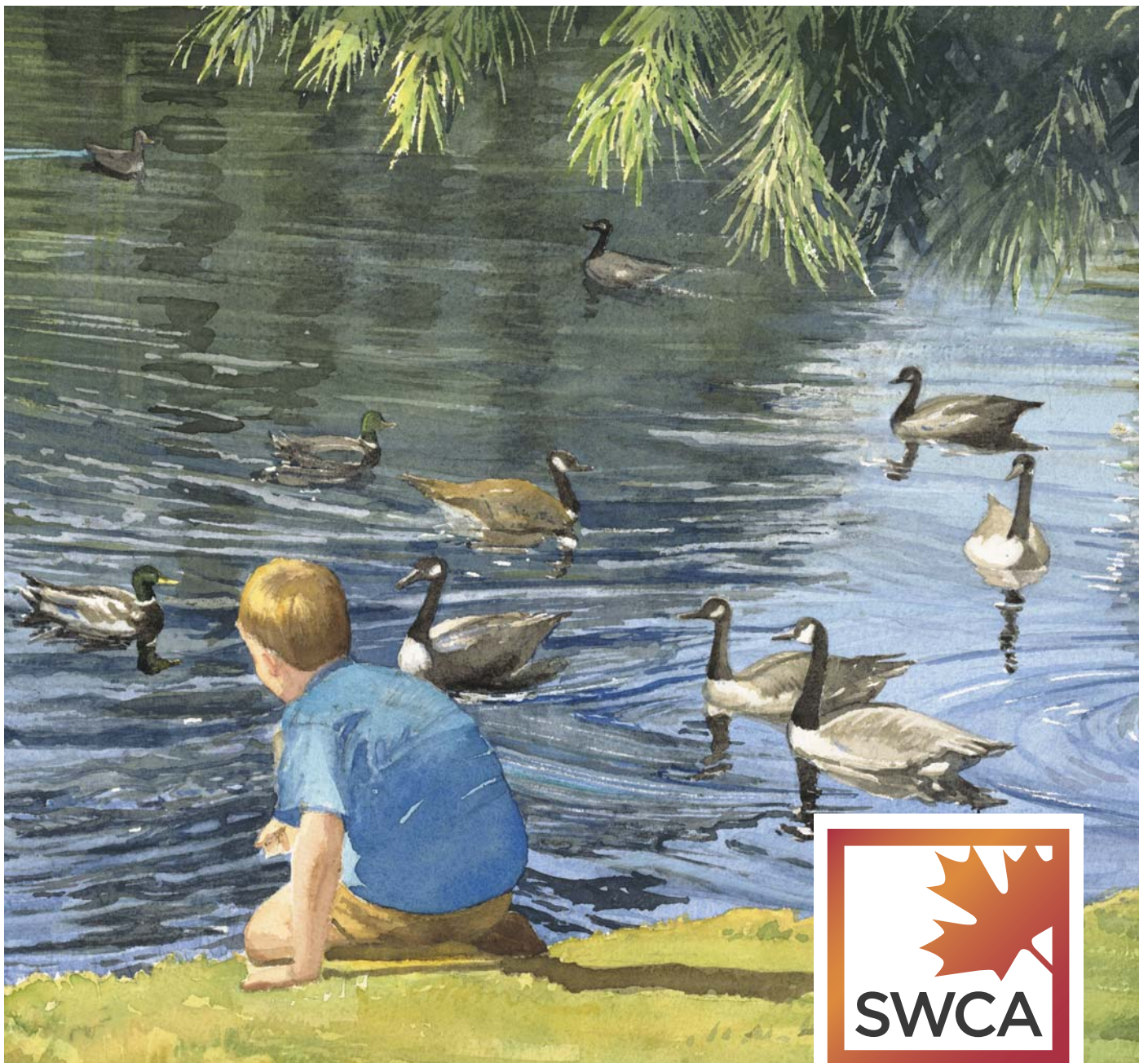
Donna Dahmer Chamberland / Feeding Time at Beacon Hill Park / Watercolour